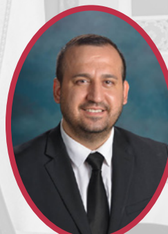
Rami Kina College II